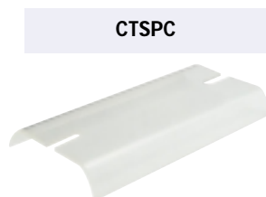
For all Rail Mounting Terminals