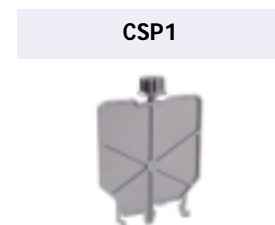
Mounting Accessories for CTSPC